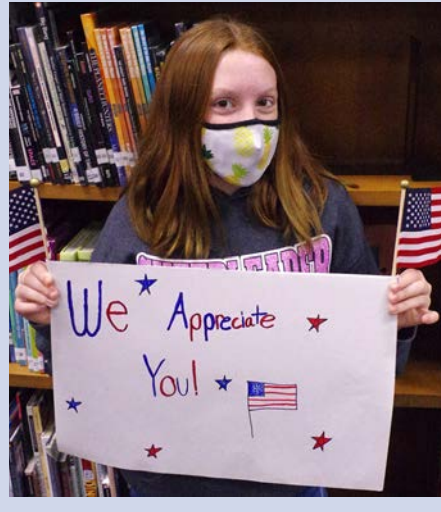
A student shows one of the signs Connor Middle Schoolers