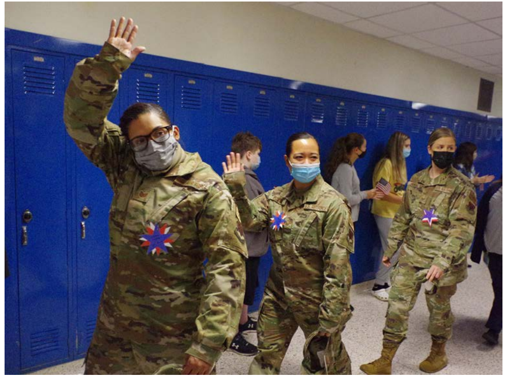
Military personnel wave to students cheering them during the Veterans Parade in Connor Middle School.

Following the festivities, veterans enjoyed a breakfast prepared by district food service staff.