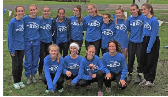
The Grand Island girls cross country team is pictured after winning the Niagara Frontier League meet at Beaver Island State Park, which earned them a share of the league championship.

was second among Section VI runners in her race and 15th overall.