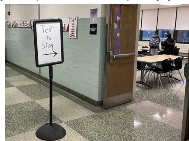
Test to Stay at Kaegebein Elementary School.

Graham said a parent will have the choice to opt in to the Test to Stay pilot program. Before