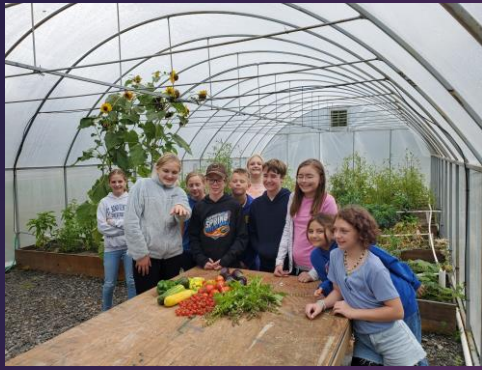
High Tunnel Growing at HMS