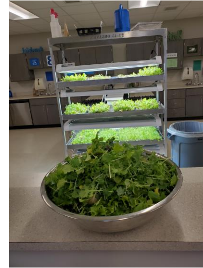
2445 Grow Rack at HMS