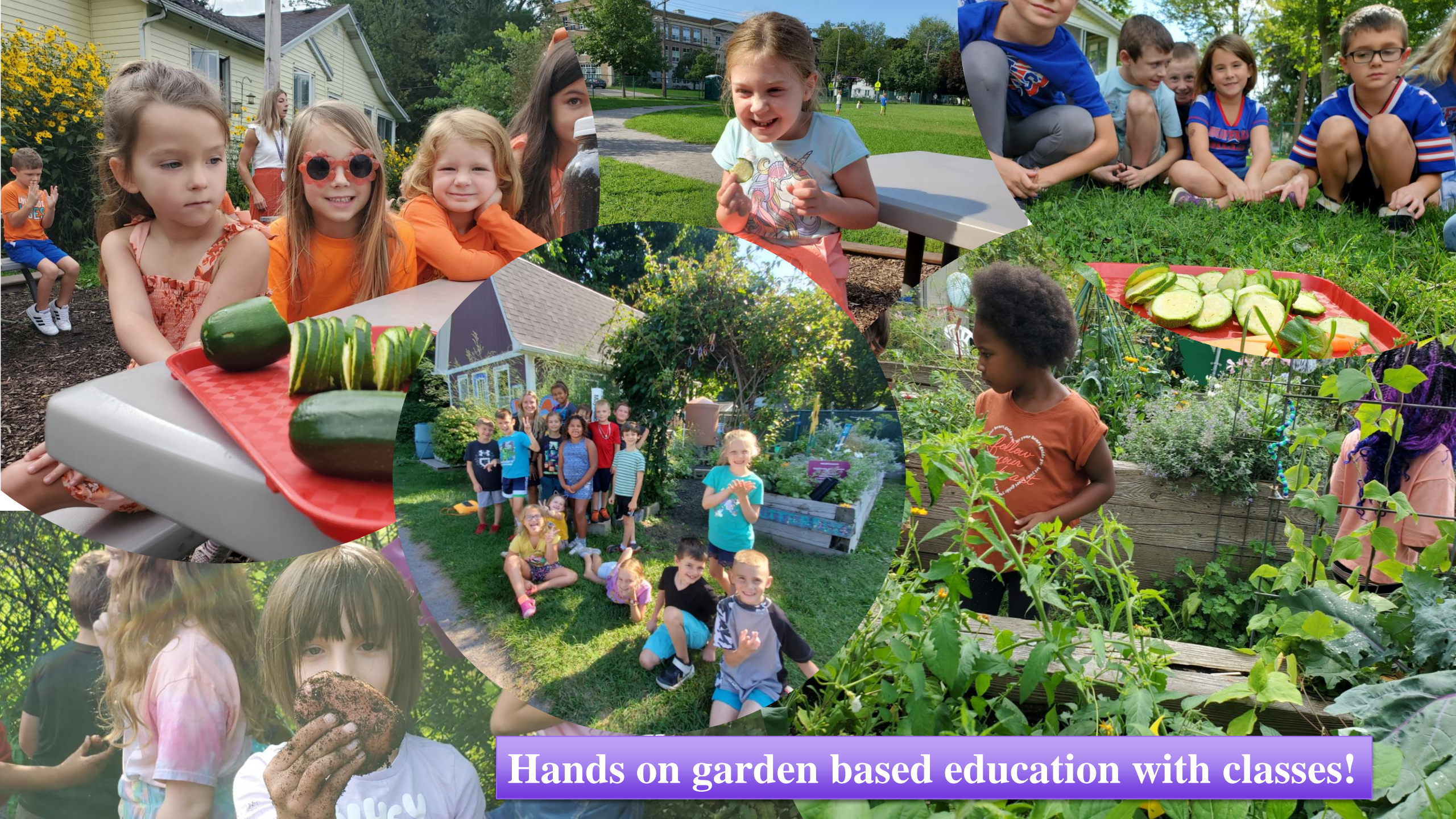
Hands on garden based education with classes!